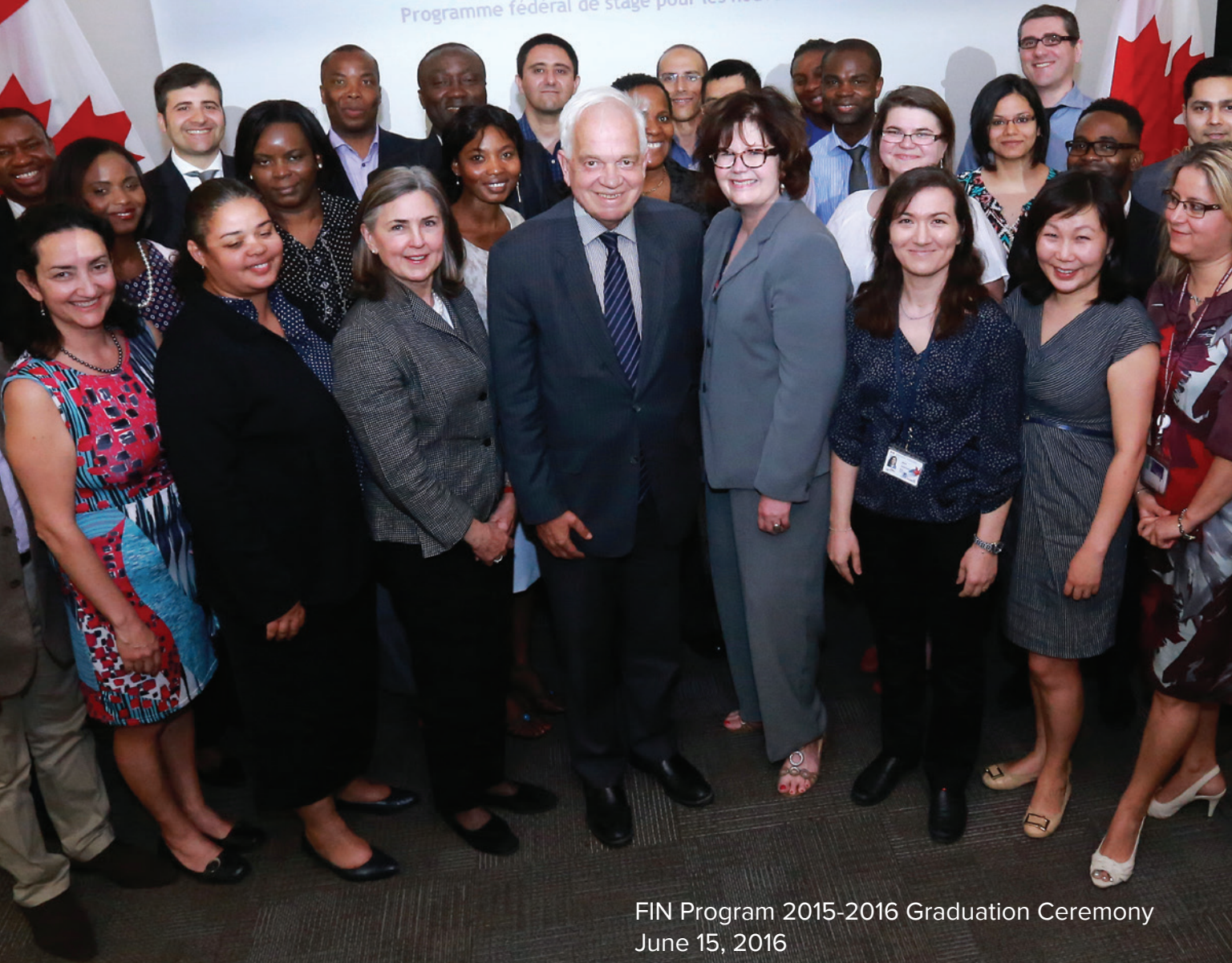
FIN Program 2015-2016 Graduation Ceremony June 15, 2016

Federal Internship for Newcomers Program Programme fédéral de stage pour les nouveaux arrivants